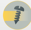
Exclusive helix tilting system by Sylvac, for more comprehensive thread measurements.