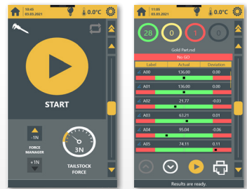
New easy to use touch screen operator interface.